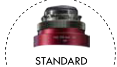
STANDARD LARGE FORMAT REAR GROUP