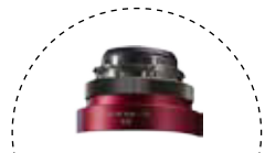
STANDARD S35 REAR GROUP