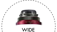
WIDE LARGE FORMAT REAR GROUP