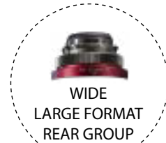
WIDE LARGE FORMAT REAR GROUP