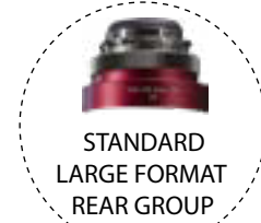
STANDARD LARGE FORMAT REAR GROUP