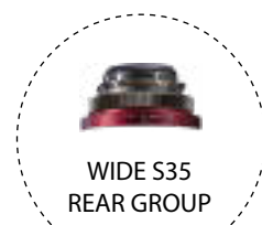
WIDE S35 REAR GROUP