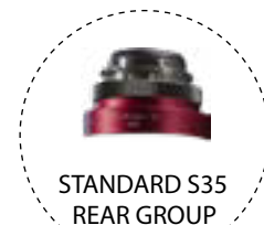
STANDARD S35 REAR GROUP